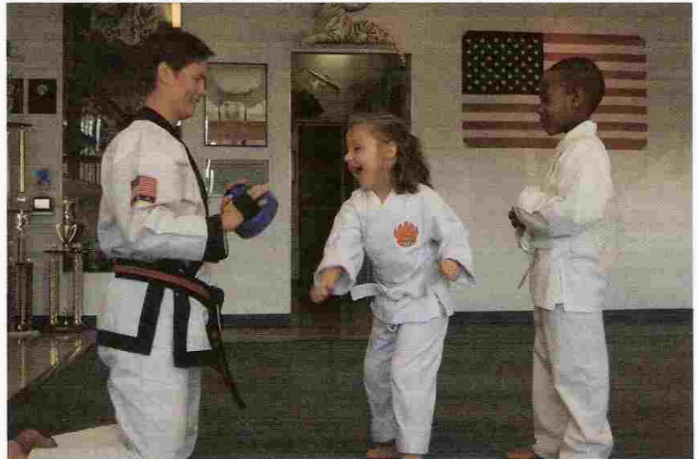
The young tiny tigers