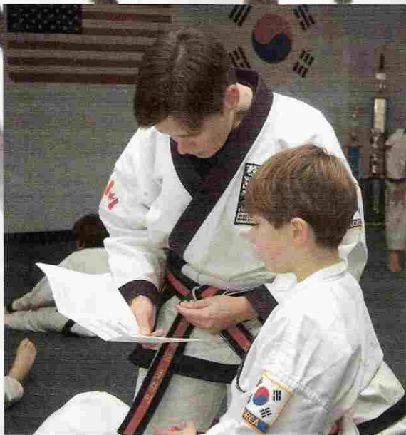
Reviewing report card with student